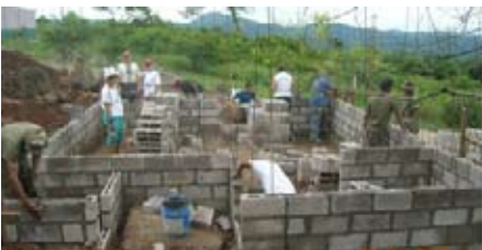
2010 Habitat group at work in El Salvador.