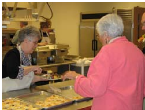
The Kitchen Kadré serves up a gourmet breakfast made from Farmers' Market ingredients.

Over 120 people enjoyed the "Welcome Spring" farmers' market and meal on March 20. Eight farmers and Family Farm Defenders participated in this day of local goodness. The ecumenical non-profit Churches' Center for Land and People (CCLP) was the event sponsor.