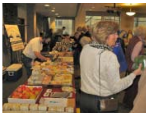
Members and friends browse a wide variety of local food items.