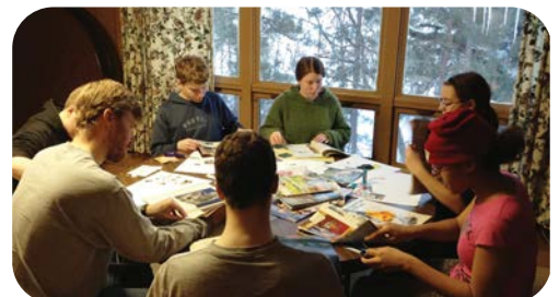
Middle School & High School Youth Activities