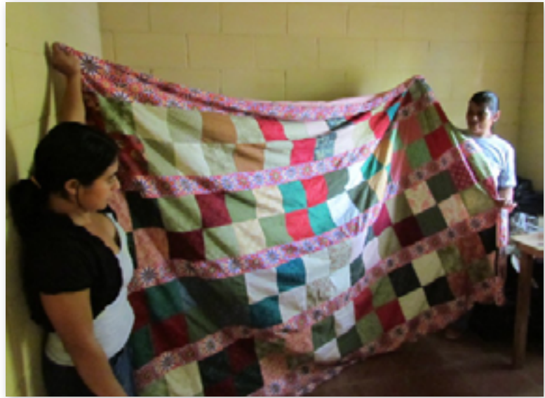
Quilt made in El Salvador by Sewing Project FUMC Supports