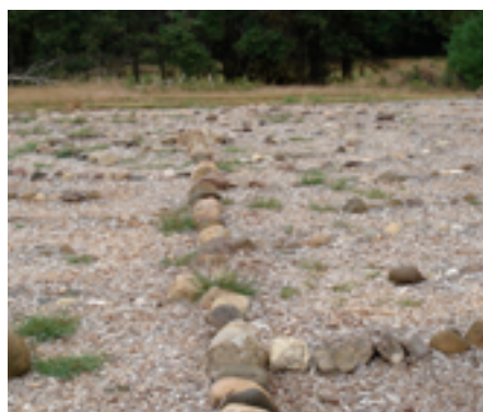
Outdoor labyrinth at Mt. Morris.