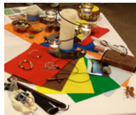
Altar display of participants' meaningful objects.